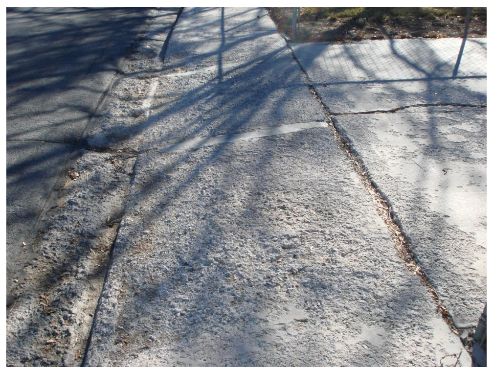
Sidewalk Deterioration/Non ADA-Compliant Drive Access