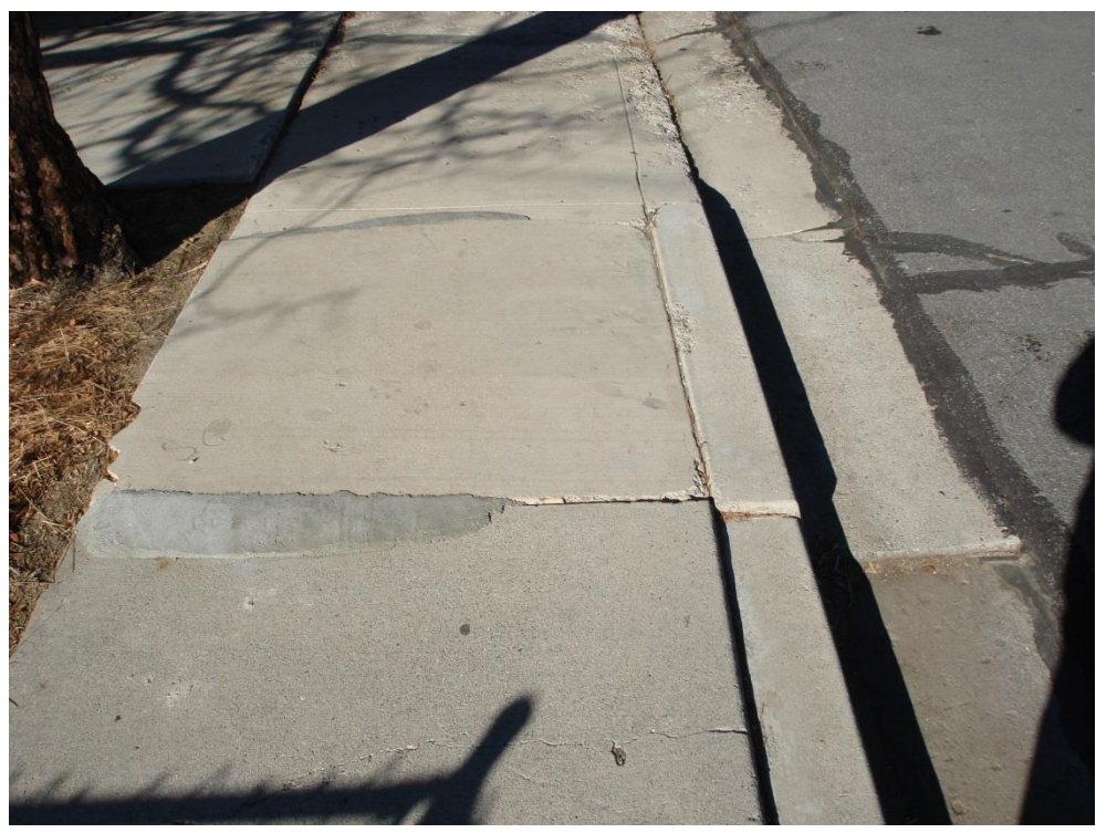
Insufficient/Temporary Patch on Sidewalk Heaving