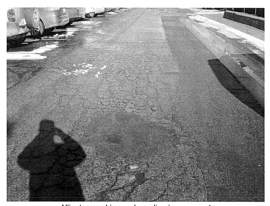
Alligator cracking and ponding in pavement