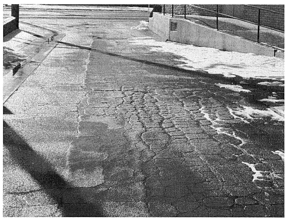
Looking south on Nichols Lane toward the intersection with Highway 50