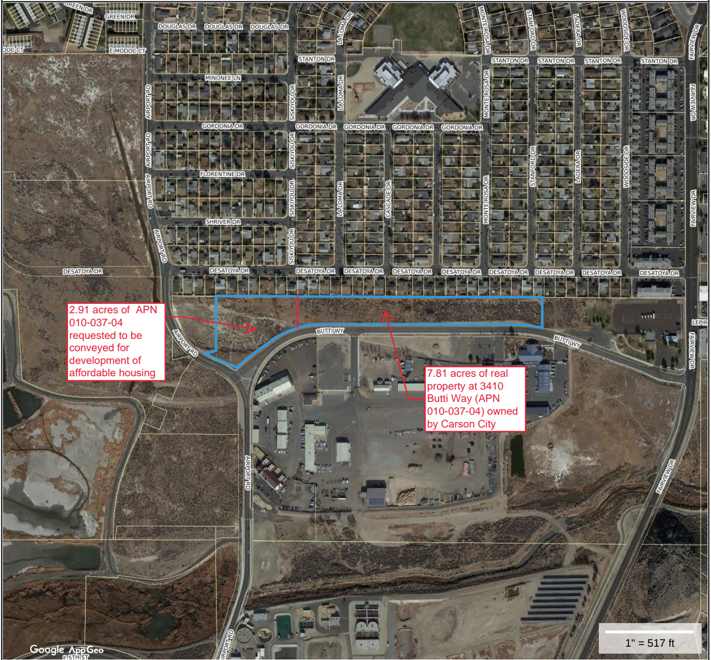
EXHIBIT B - Vicinity Map

2.91 acres of APN 010-037-04 requested to be conveyed for development of affordable housing